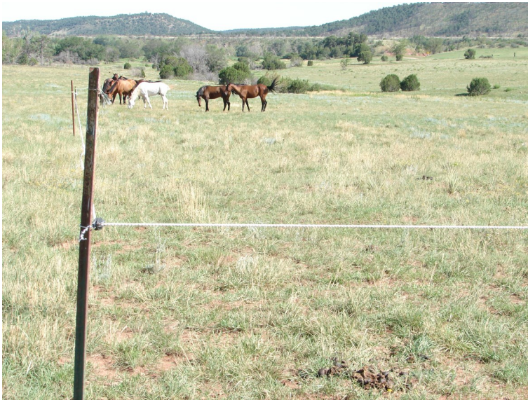
Figure 1: Temporary fencing is used to subdivide this pasture. Temporary fencing allows flexibility in layout, and is cheaper than permanent fencing.

By J. Cook, D. Nosal, J. Rizza, S. Bokan, and E. Lockard.*