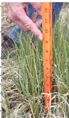
Table 1: Protective Grazing Heights for Key Forage Species • Circle the dominant forage species that are growing in your pasture. • The grazing heights listed for each species should be maintained. • Use a ruler to monitor grass growth. Monitor grasses before, during, and after grazing periods.